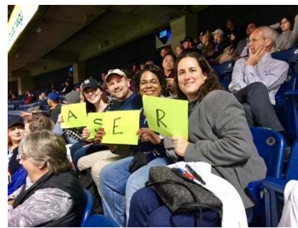
ASER enjoying the Toronto Blue Jays Baseball Game!